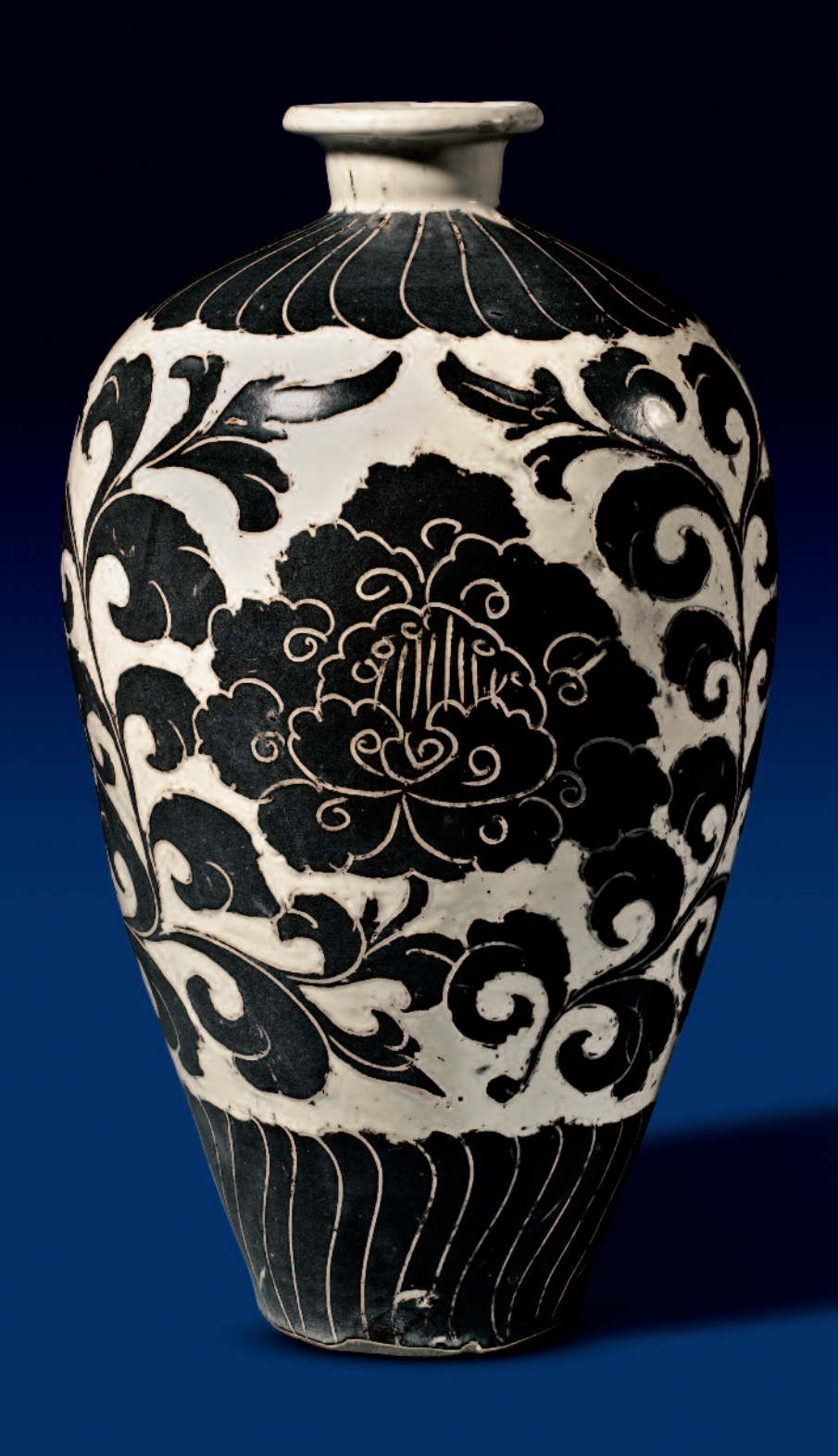
J. J. LALLY & Co. ORIENTAL ART